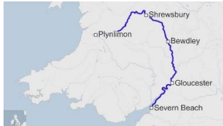
Map of the River Severn