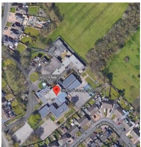
Aerial view of Straits Primary School.

Walking around the school grounds, we used our fieldwork skills to identify different features of the school grounds. Look at this map and identify different areas of the school.