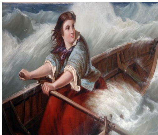
Grace Darling painted by Thomas Brooks

Grace was the first woman to get a medal from the RNLI. Queen Victoria wrote a letter and gave a reward to Grace Darling, so Grace Darling became famous. After hearing about Grace Darling, Victorian people started to realise how important lifeboats are for rescuing people in danger at sea.