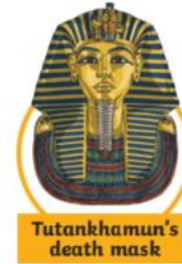
Tutankhamun's death mask

Tutankhamun was Pharaoh from 1333BC to 1323BC. He was known as the 'boy king' because he became Pharaoh at age 9. His tomb was discovered in the Valley of the Kings by Howard Carter and his team in 1922. His tomb contained many treasures. The discovery helped people to understand more about the Egyptians pharaohs.