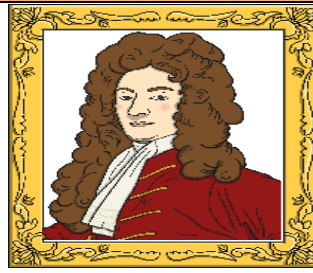
Sir Christopher Wren